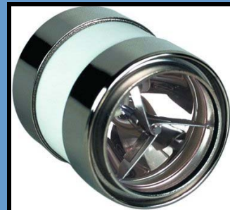
CeraLux Xenon Collimated Arc Lamp