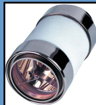
CeraLux Xenon Focused Arc Lamp

CeraLux xenon lamps produce broadband light with color temperatures of approximately 5900°K. This results in excellent white light for photopic, video and photographic applications.