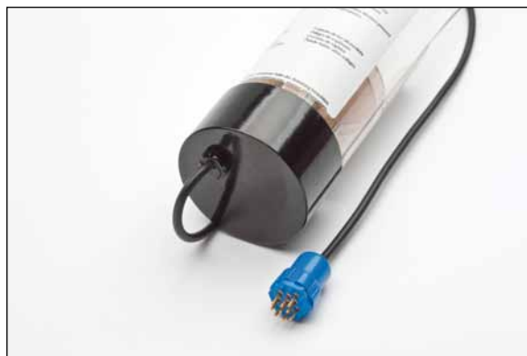
50 mm Standard