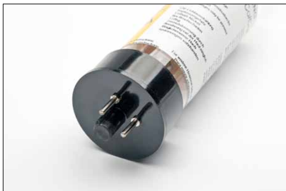
37 mm Standard, 37 mm Self Reversal